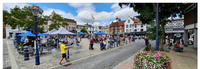
Hitchin Market Place, a historic market town in North Hertfordshire. Improvements were made to the town centre in 2022, to prioritise pedestrians.