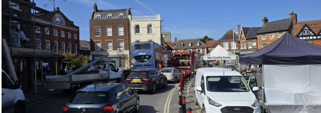
Wantage Market Place suffers with daily congestion of vehicles passing through and not stopping.

Our vision for Wantage Market Place is to create a vibrant, welcoming, and accessible space for everyone.