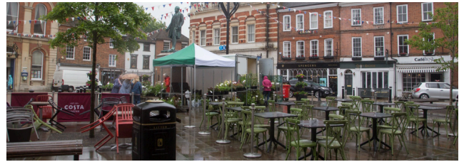
Romsey, Hampshire, a historic market town near Southampton that was regenerated in 2019.