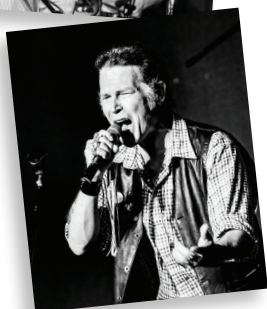
A-Watts (top two) and Thunderbird (above) performing at the Festival Rock Party