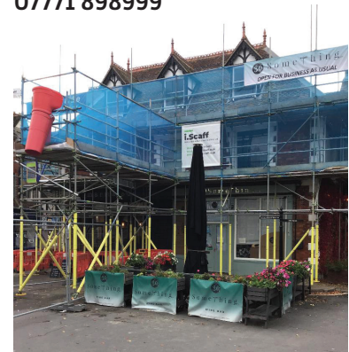
Building in progress at the west end of the Market Place