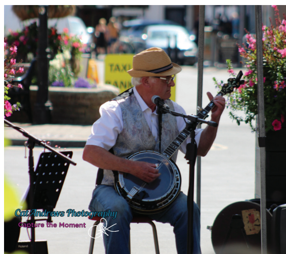
Whoosya! playing in the Market Place

Despite considerable hurdles, our month-long Festival of local art and music from July 1 to 31 went ahead with over 40 events from art exhibitions to a wide range of music. The festival programme was delivered to every home in Wantage (as was a list of organisations which local residents, especially newcomers, can join.)